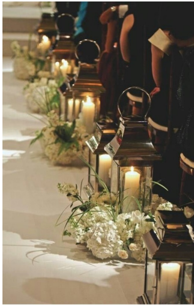
Wedding room decoration: